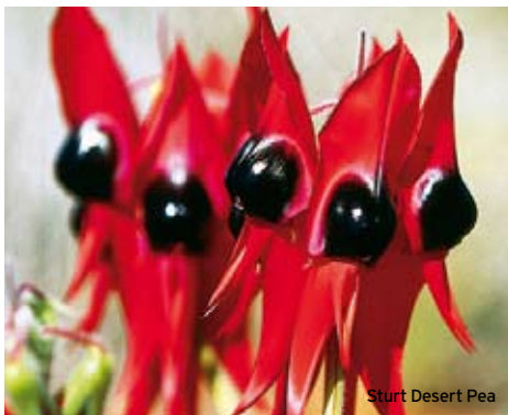
Sturt Desert Pea