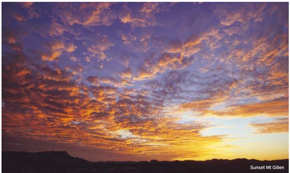
Sunset Mt Gillen

AAT Kings Tours 1300 556 100 Aboriginal Desert Discovery Tours 08 8952 3408 Aboriginal Dreamtime & Bushtucker Tour 08 8955 5095 Adventure Tours Australia 1300 654 604 Alice Springs Airport Shuttle 08 8953 0310 Alice Springs Helicopters 1300 669 225 Alice Springs Holidays 1800 801 401 Alice Wanderer Centre Sightseeing 1800 722 1111 APT - Australian Pacific Touring 1800 891 121 Austour 1800 335 009 Australasian Jet NT Aircraft Charter and Management 08 8953 1444 Ballooning Downunder 08 8952 8816 Centre Highlights 1800 659 574 Connections Adventures 1800 807 251 Connections Safaris 1800 807 251 Desert Tours & Transfers 08 8950 3030 Discovery Ecotours Australia 1800 803 174 Down Under Tours (Australia) 08 8953 4455 Dreamtime Tours 08 8955 5095 Dysons Group of Companies Inc Cobb & Co Coaches 1800 686 442